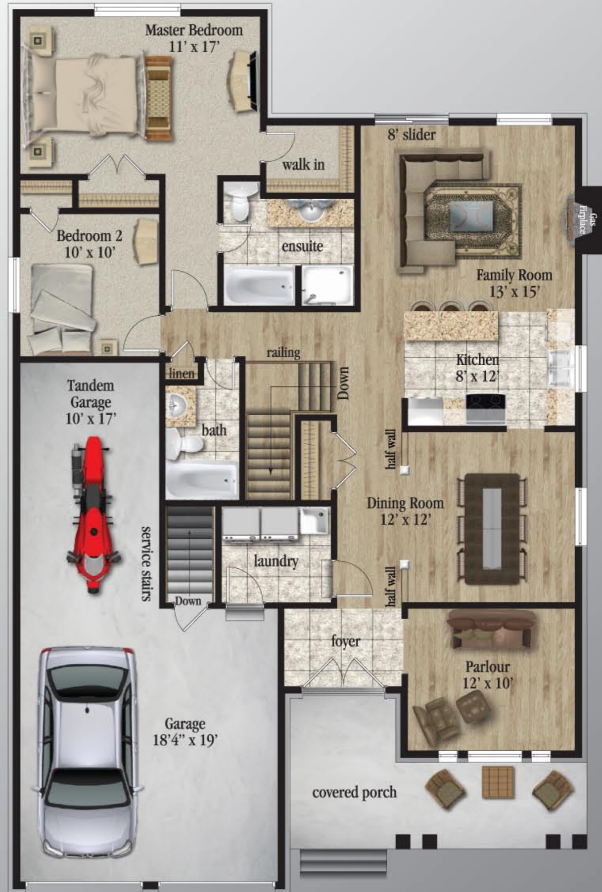
Main Level • 2 Bedroom