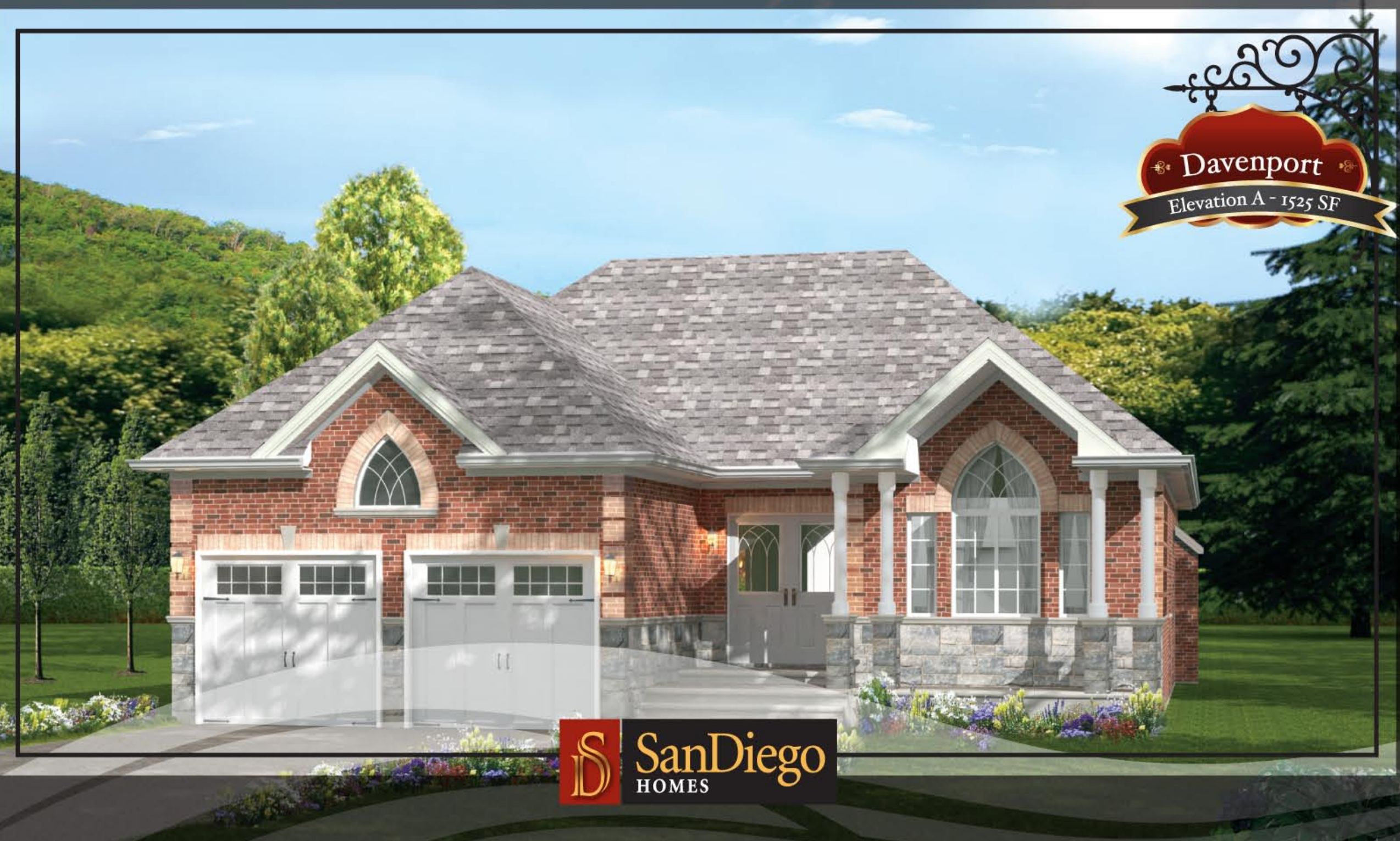
Davenport Elevation A - 1525 SF