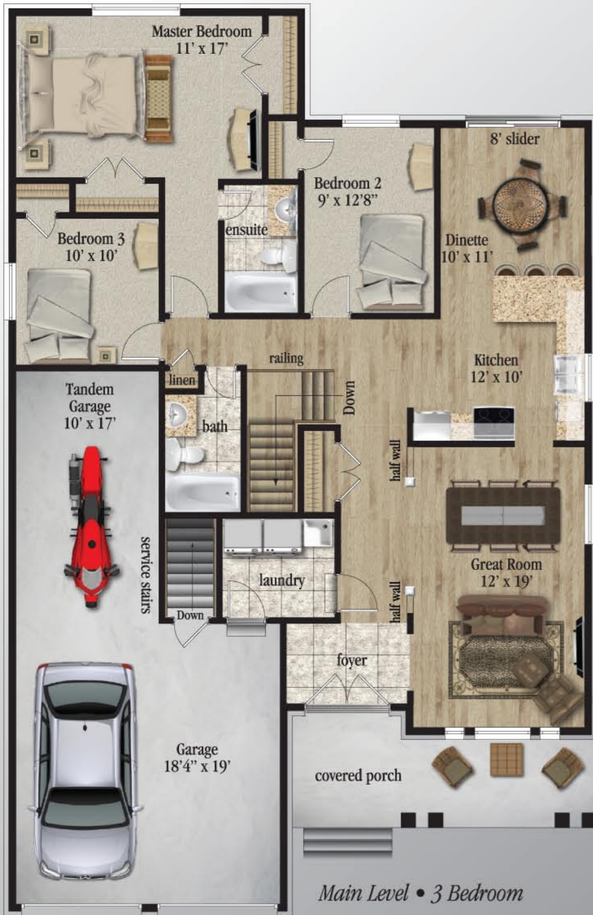
Main Level • 3 Bedroom