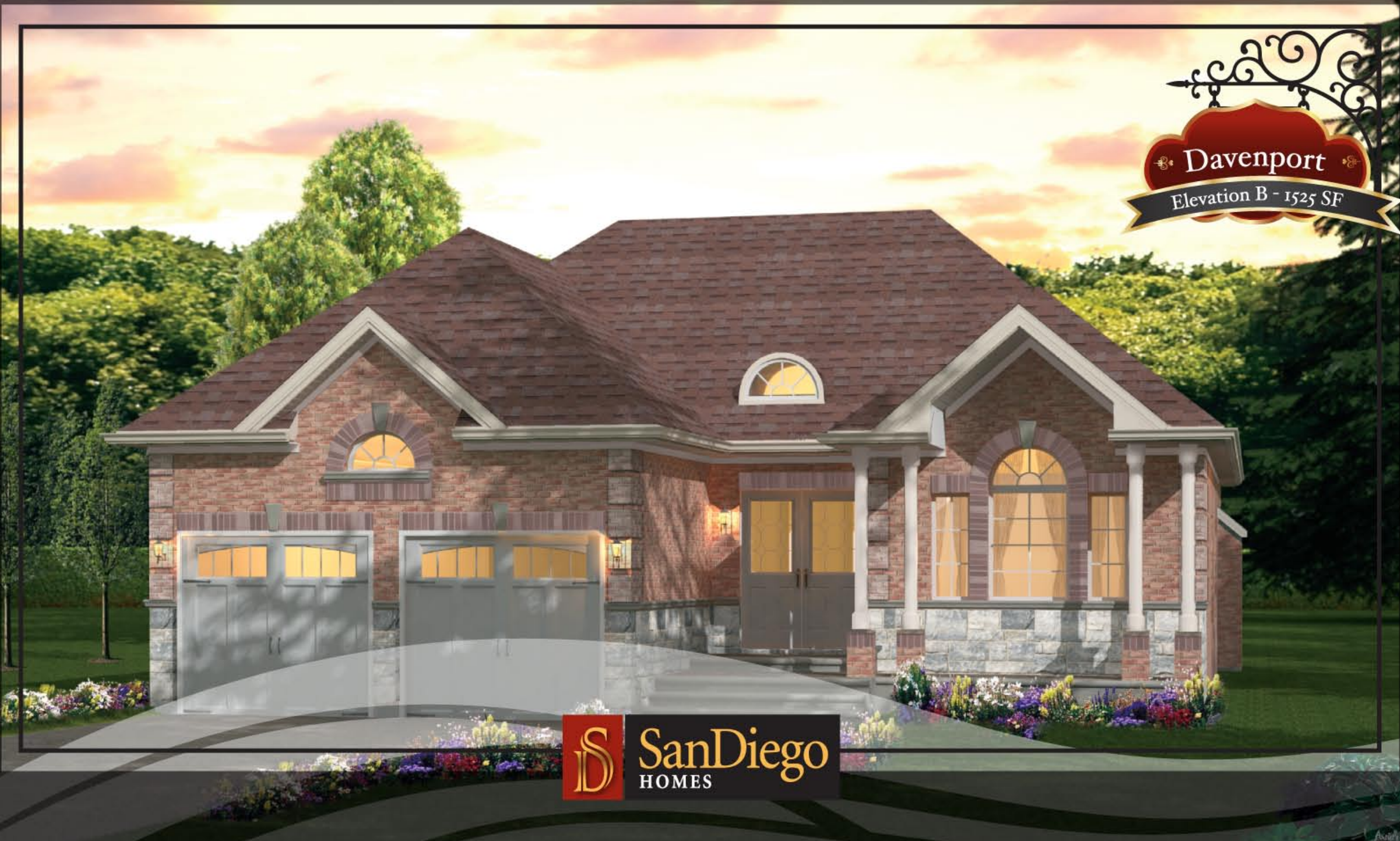
Davenport Elevation B - 1525 SF