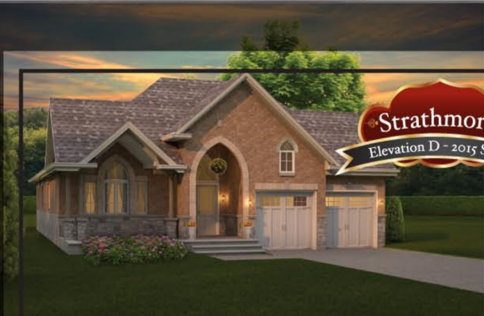
Strathmore Elevation D - 2015 SF