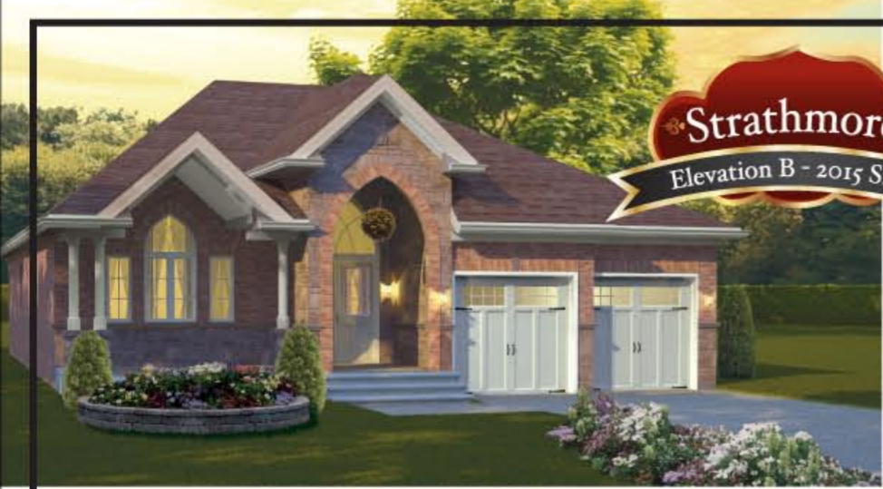
Strathmore Elevation B - 2015 SF